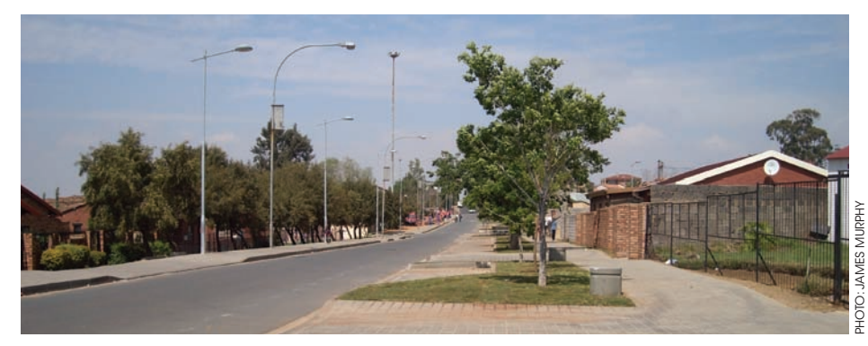
Street upgrade in Soweto, Johannesburg

areas. Such opportunities may include infrastructure platforms needed to facilitate future economic development, public transport systems, initiatives that make an area attractive and create a pleasant living and playing environment, the provision of quality government services for residents.