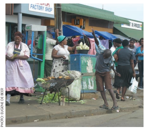
Local enterprise, Nongoma

The TRS is helping to secure external investment partners. For example, it has been given to potential investors interested in the taxi rank development.