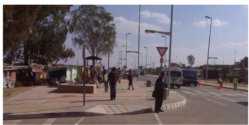
The same corner, after the upgrade