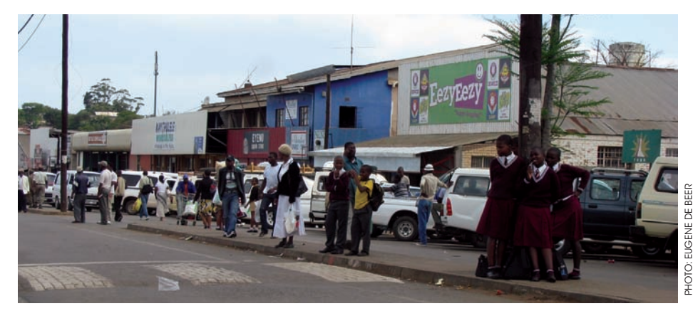
Waiting for transport, main road, Nongoma

The Nongoma TRS forms part of the Nongoma Urban Regeneration Study (2009), an integrated planning document for the whole municipality (see Box 2).