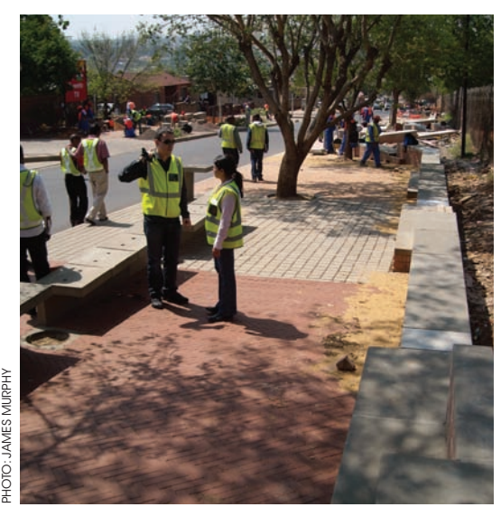
Work in progress, Vilakazi Street, Soweto, Johannesburg

Leverage is not a new concept to CoJ, which has many partnership projects. However, there are still projects that are implemented without giving adequate thought to their future financial sustainability and how they can attract non-municipal funding partners. The TRS can be used as a tool to promote the idea of leverage.