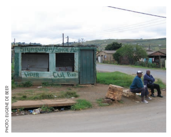
Informal traders operate along many roads in Mpophomeni

The TRS is illustrated with aerial land-use photographs and other photographs of specific areas to show types of buildings, conditions of roads and so on. These will provide useful visual records against which to measure progress.