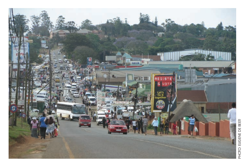
Congested CBD, Nongoma

Make sure that the TRS is written clearly, without unnecessary theoretical language so that it is accessible to people working at strategic and project implementation level. Including tables to show how the projects link to the strategic objectives and criteria for project monitoring and evaluation also help to make the document a practical tool. Photographs, maps and plans of