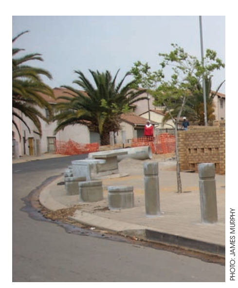
Upgraded street in Soweto

Different levels of planning documents, such as the regional SDFs and municipal IDPs