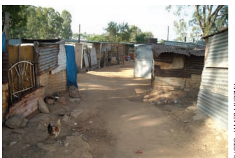
Diepsloot, one of the focus areas in the CoJ's TRS

The key attributes, objectives and strategic actions for the creation of liveable neighbourhoods and economic opportunity zones form a framework within which the CoJ can implement specific projects. Within any particular township, the projects are grouped according to whether they work towards the creation of a) a liveable neighbourhood or b) an economic opportunity zone.