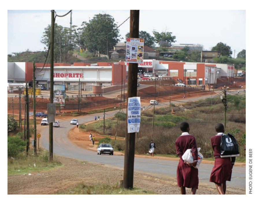
A retail centre about 1km from Nongoma's CBD

When the NDPG application was submitted to the NDP, the municipality had already identified an area within the CBD that would benefit from municipal investment, stimulate further activity and encourage private investment. This included developing a bus and taxi rank, rehabilitating key roads, and developing a cultural museum opposite the municipal office on the site of an historic battlefield.