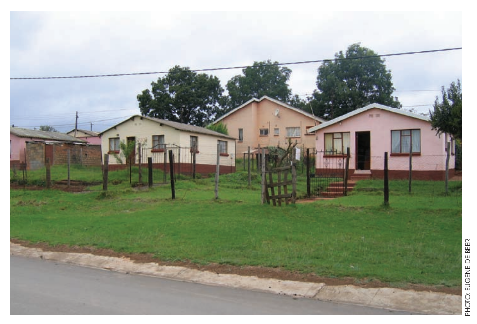
Most streets in Mpophomeni have grass verges and trees