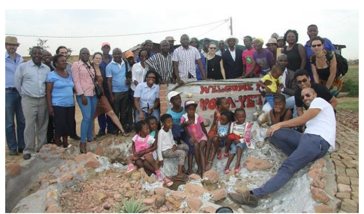
The workshop concluded with a site visit to the community of Duduza in Johannesburg, where young people affiliated with the Federation of the Urban and Rural Poor (FEDUP) are tackling unemployment as well as drug and alcohol abuse within the community.

Finally, national and local authorities must see youth not as problems, but as problem solvers. Young people are experts of their own territories, and local authorities should use (and value) their innovation and expertise in achieving sustainable city development.