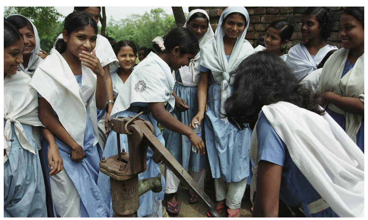
Students getting water in Bangladesh.

When young people are engaged in their communities, they make important contributions through the programmes they run, the jobs they create, as well as the skills and knowledge they enhance in others (the social and financial capital they build). Moreover, through their work they learn important insights about the policy-related and institutional changes that need to be made to further enhance the lives of their communities. As cities search for new and creative solutions to the challenges they face, they may discover they have been overlooking a resource that was there in growing numbers all along.