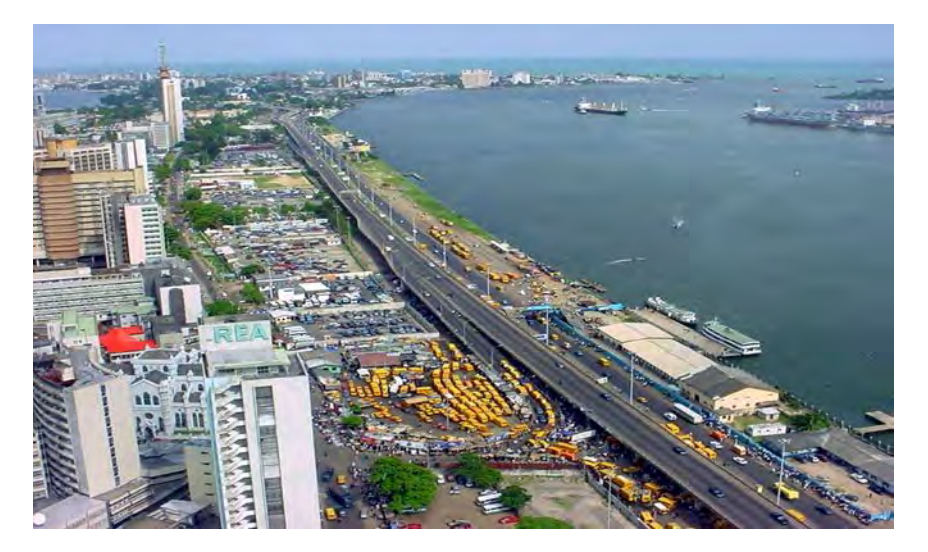
Aerial view of the Lagos Island Central Business District.

The city's internal structure is in line with the concept of the "multiple nuclei structure," as postulated by preeminent African urbanist Professor Akin Mabogunje. Lagos has several central business districts, including the Lagos Island Central Business District, which houses many of the city's largest wholesale markets, such as the Idumota and Balogun markets.