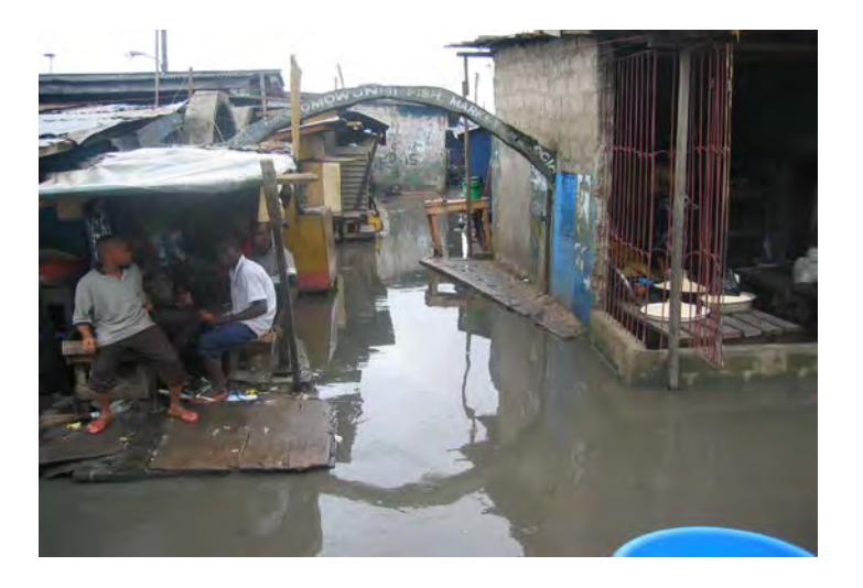
Lagos' coastal location means flooding is a major challenge for upgrading slum communities.

Historically, governance and policy responses have been unable to sustainably plan and manage the city's development. With no strategic urban planning, the city has had to contend with challenges such as uncontrolled urban sprawl, inadequate and overburdened infrastructure, housing shortages, social and economic exclusion, high youth unemployment, inadequate funding of urban development, rising crime and physical insecurity, cumbersome judicial processes, and low-level preparedness for disaster management. In addition, a large informal sector has developed, primarily as a result of in-migration of unskilled labour.