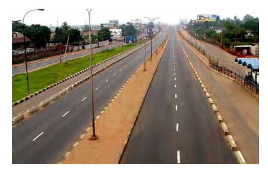
Lagos' BRT system has created dedicated lanes for bus traffic, reducing traffic congestion.

The BRT system has reduced the major challenges of mobility in the city, especially in the busy Mile 12-CMS corridor and its catchment areas. As of January 2010, it had moved more than 114 million passengers and helped bring order to public transportation by promoting the concept of an orderly waiting line at bus shelters. Commute times