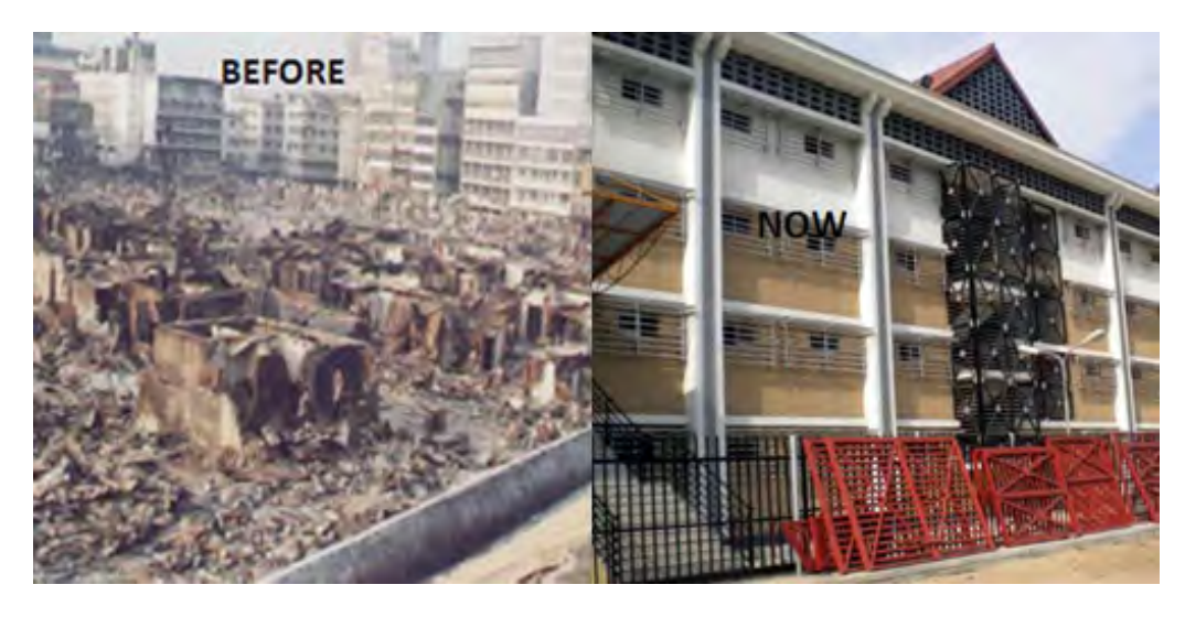
Slum Redevelopment in Lagos Megacity, Before and After.

However, community inclusion, an essential component of the urban regeneration process, allows communities to prioritise their needs and inform the executing agency. To this end, slum redevelopment projects in Lagos were preceded by surveys to profile the communities, leading to more informed choices for various stakeholders. Pursuit of slum redevelopment according to this approach ensured participation because the interests of the property owners were addressed. These projects were conceptualised at Isalegangan, and to date, about 13 families have signed up to submit their properties for redevelopment.