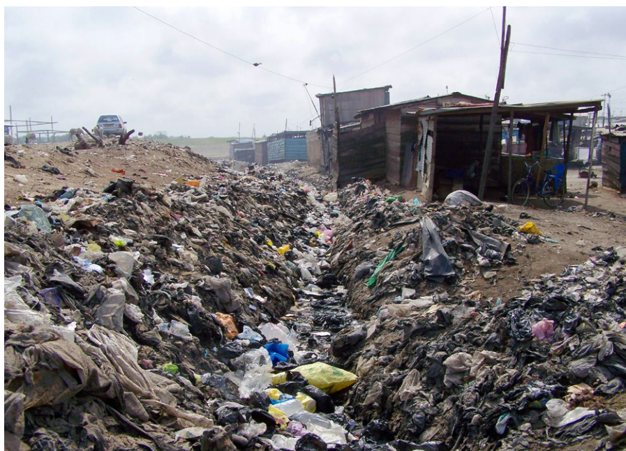
The Ghana Country Programme is helping to bring all 11 agencies responsible for sanitation in Greater Accra together to solve the city's massive sanitation challenges.

Formally approved on 18 July 2013, Ordinance No. 317 regulates procedures and measures to be adopted in cases of involuntary resettlement of families from their homes or business (place of economic activities), caused by the execution of programmes and actions under the management of the