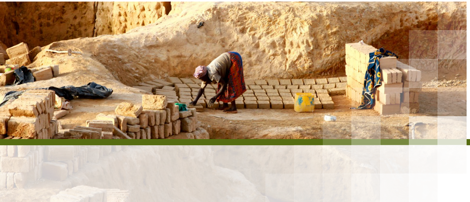
The majority of dwellings in Ouagadougou are constructed of traditional mud bricks.