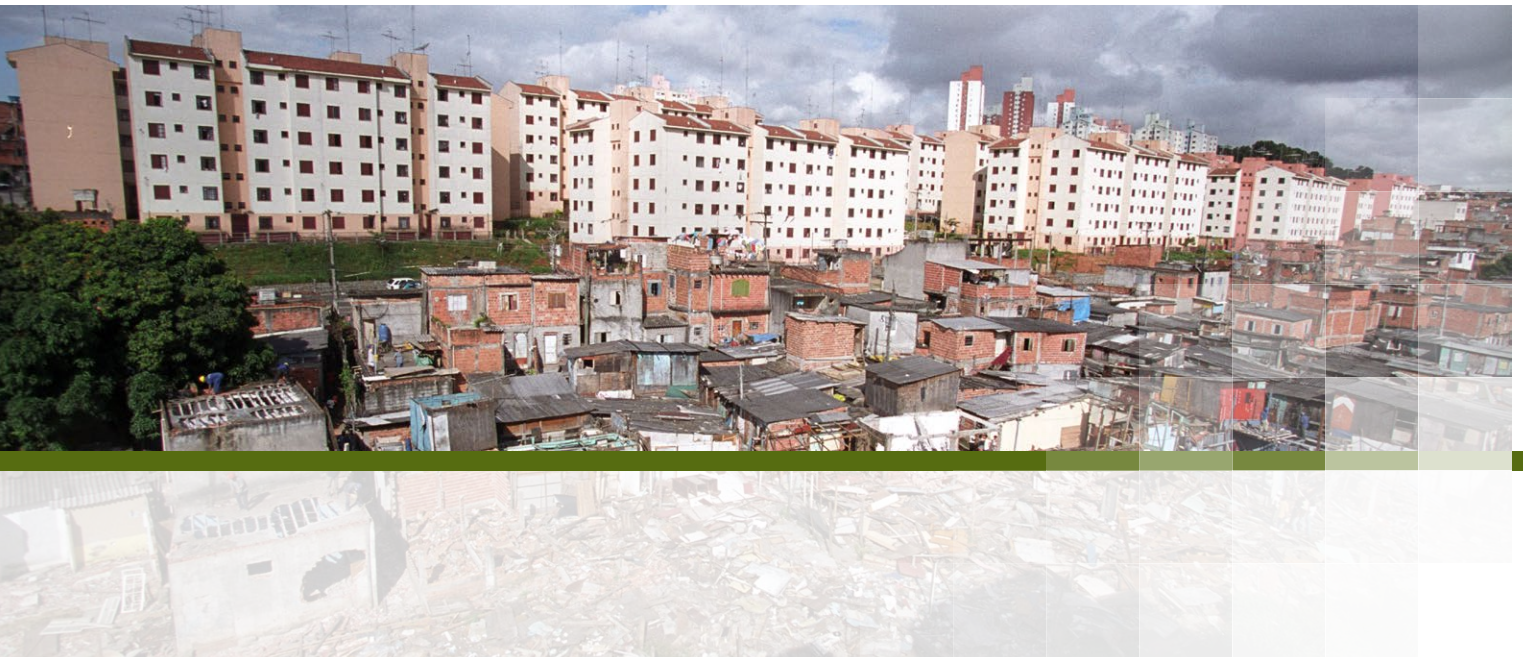
Slum upgrading in São Paulo, Brazil.