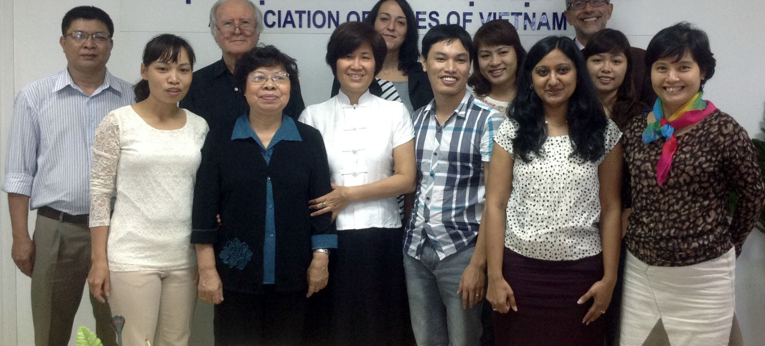
Association of Cities of Vietnam (ACVN) staff meeting with representatives of the Cities Alliance in November 2013. The ACVN is a key partner in the Vietnam Country Programme.

promoting improved coherence of effort among and between Cities Alliance members and partners.