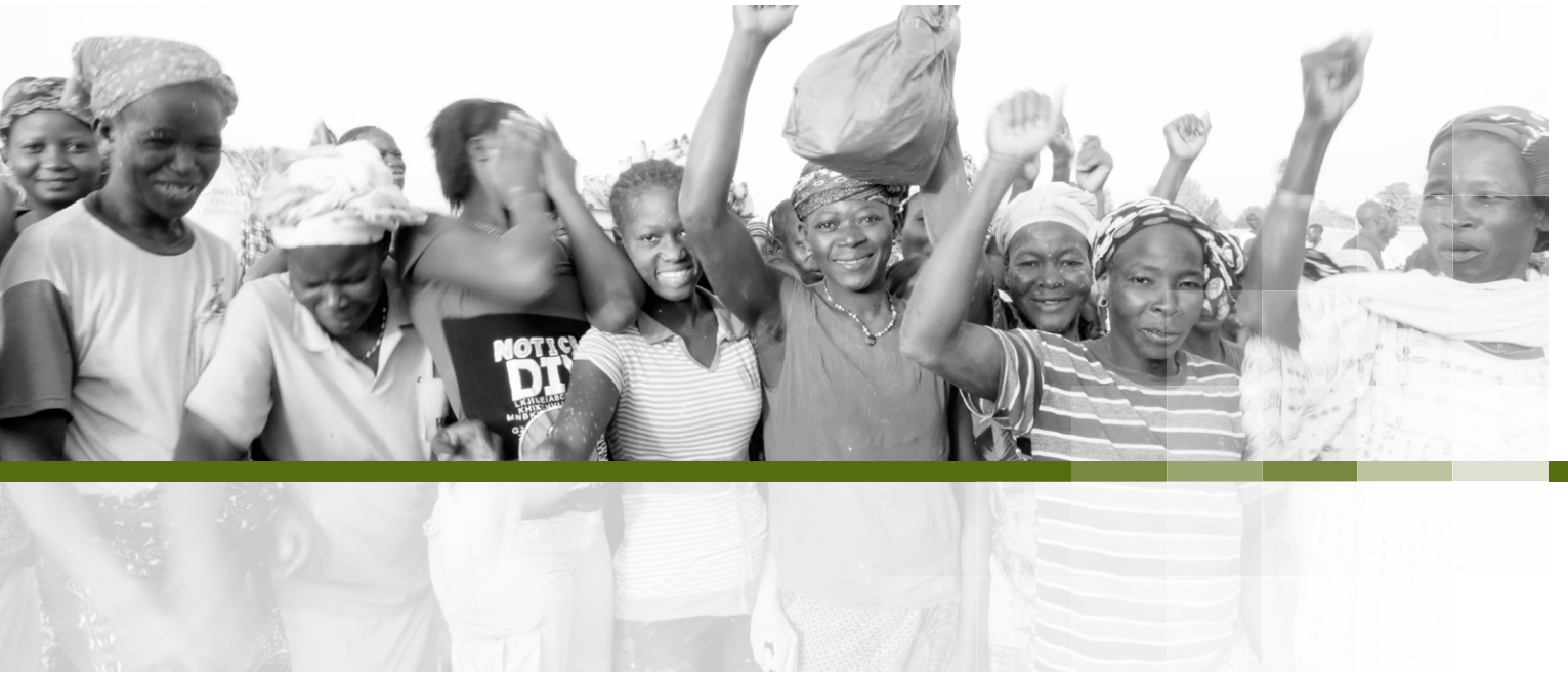
Women brick makers in Burkina Faso.