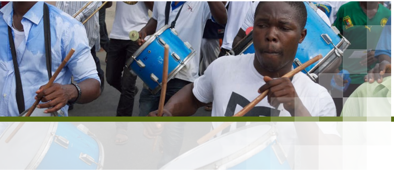
Residents of at-risk waterfront communities in Port Harcourt, Nigeria march to draw attention to the rights of slum dwellers.