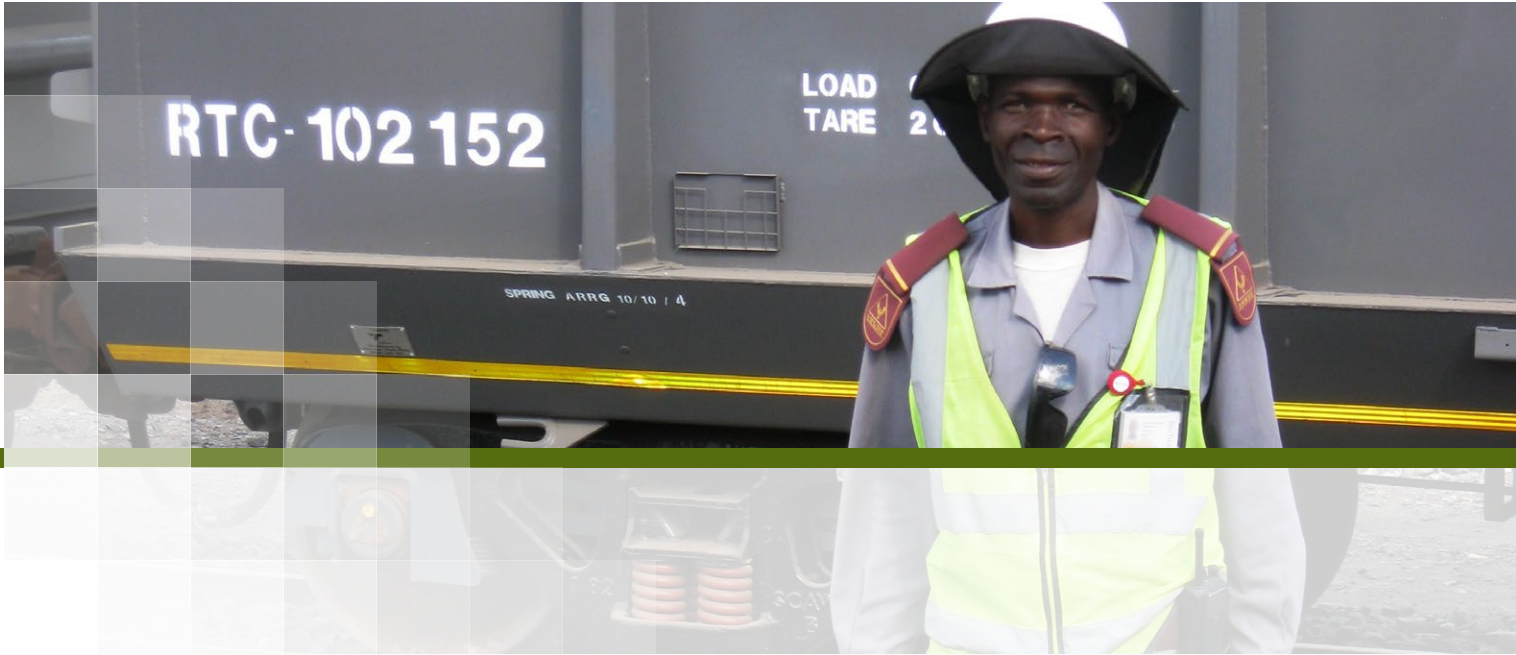
Train worker in Moatize, Mozambique.