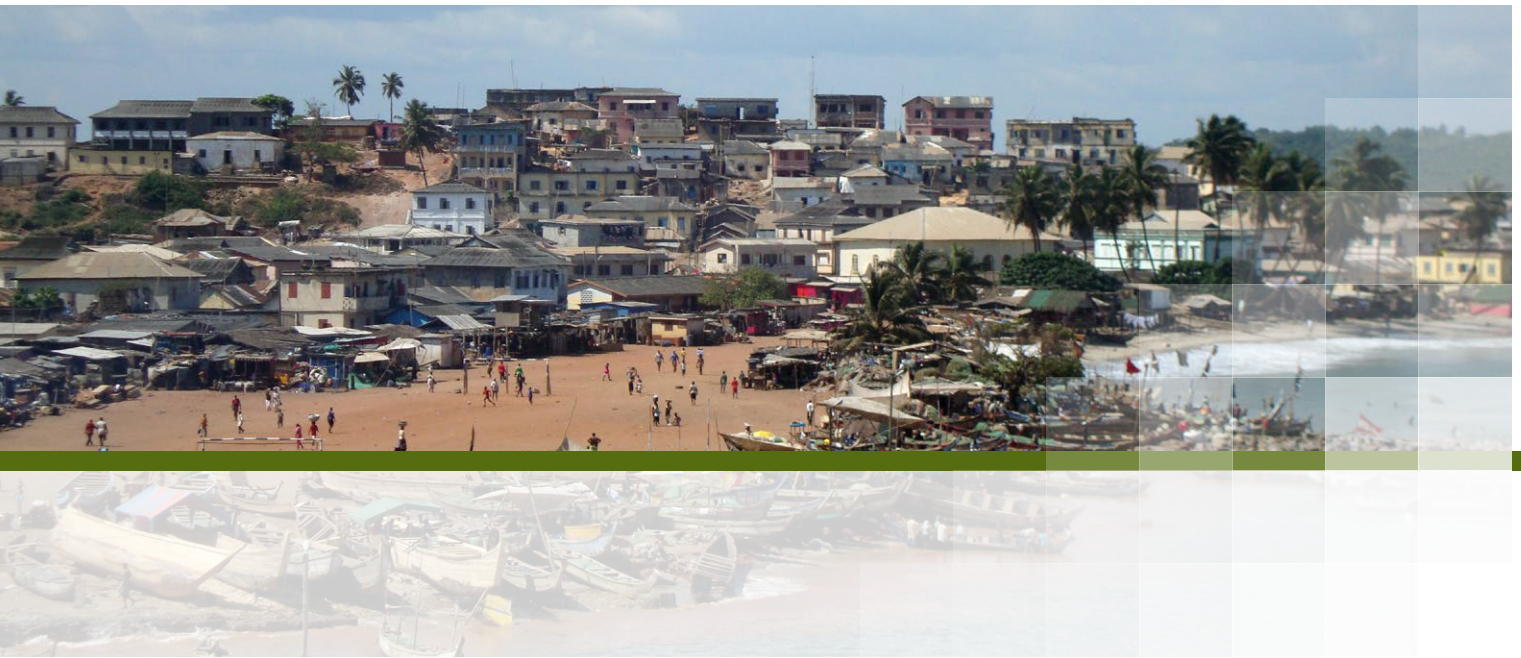
Cape Coast, Ghana.