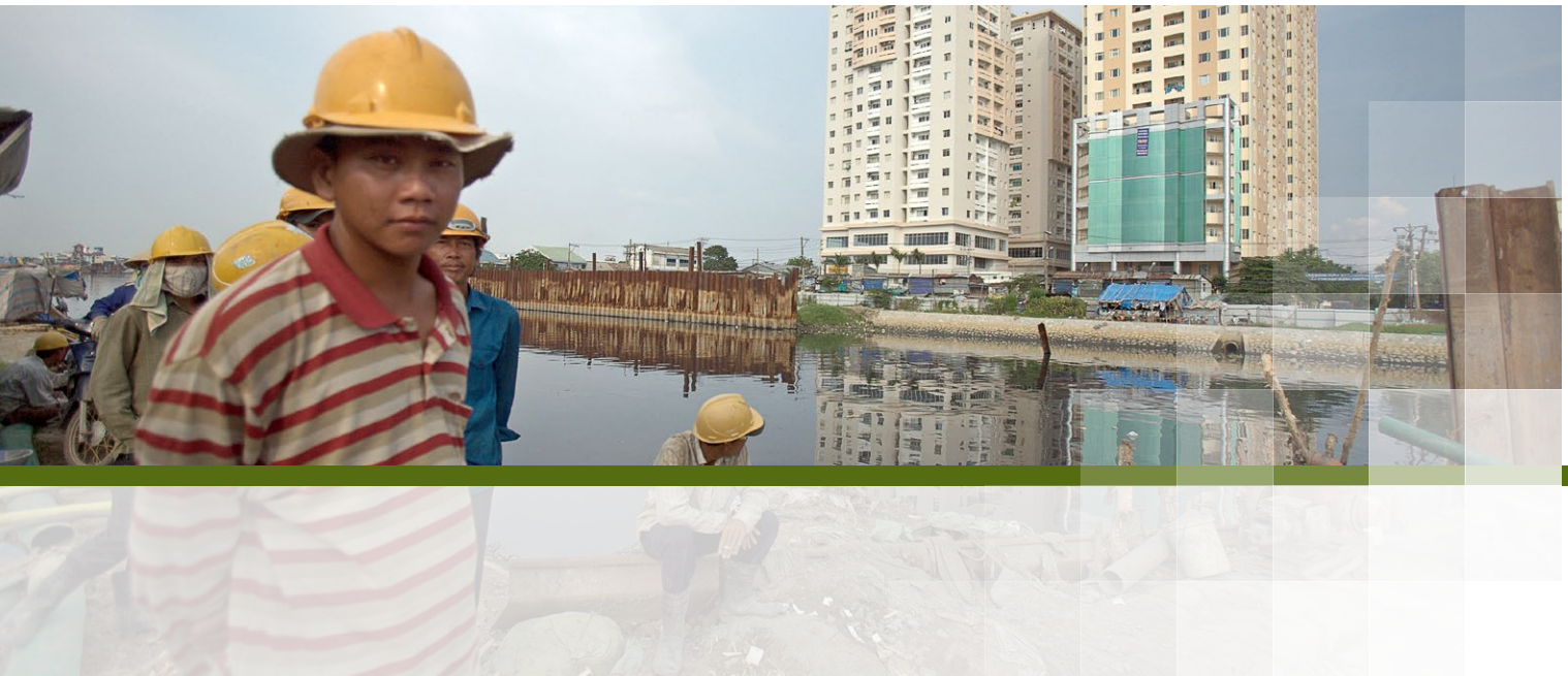
Urbanisation in Ho Chi Minh City, Vietnam.