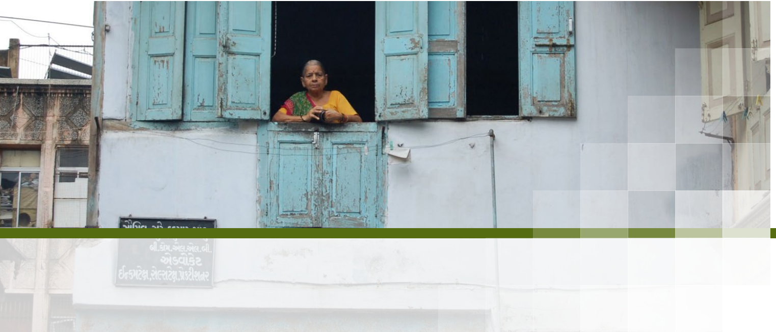
Resident of a community benefiting from a Cities Alliance pilot programme to promote inclusive, heritage-based city development in India.