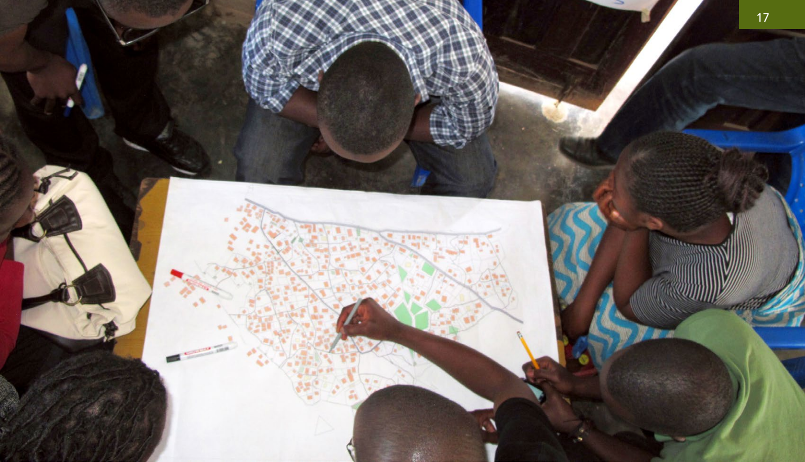
Urban studios, such as this one in Malawi, bring urban planning students out into communities where they learn about the realities of planning in informal settlements.