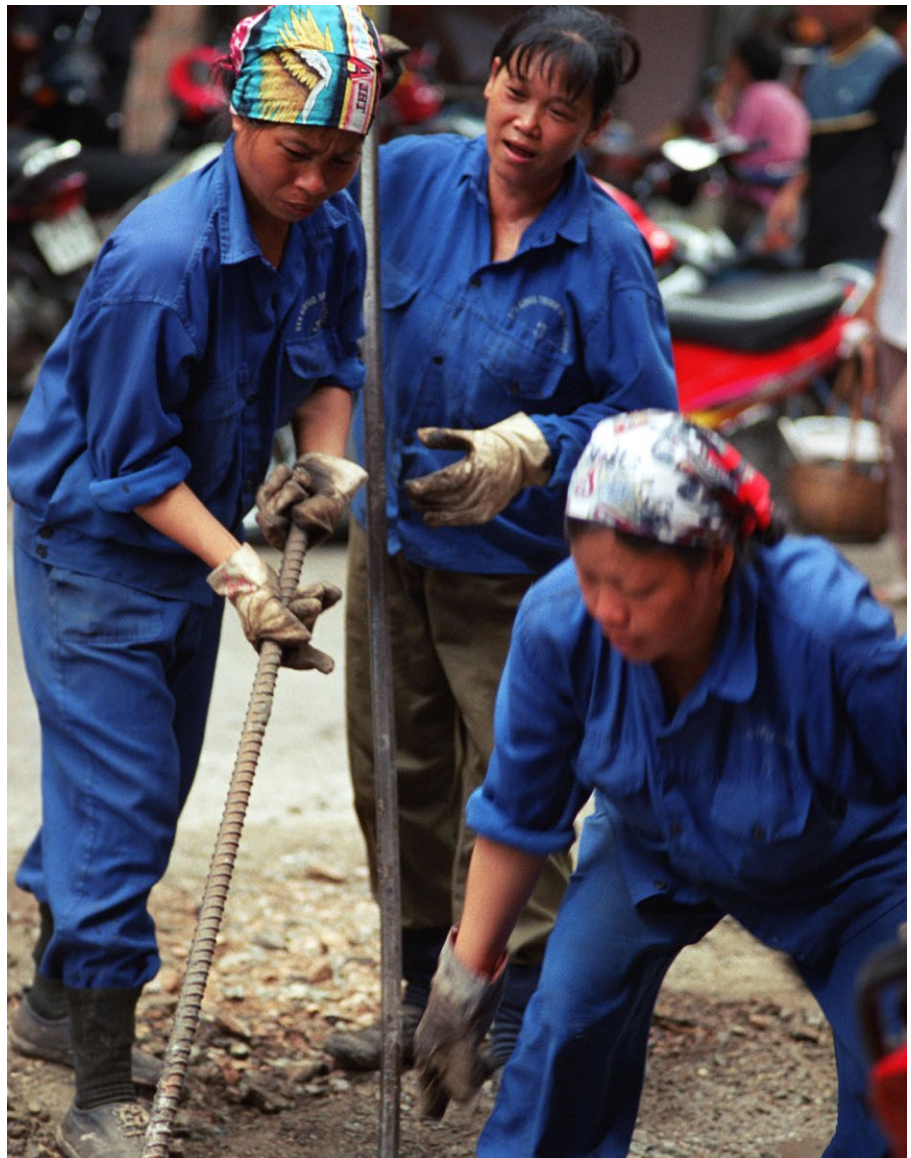
Providing services in Hanoi, Vietnam.

Each of the four outcomes addresses a specific urbanisation need or gap at different levels (national, city or community). However, it is important to note that they all work together to foster the necessary conditions for inclusive urban development and should be viewed as a comprehensive framework. No local government can be fully effective without an enabling national environment; at the same time, no local or national strategy can have an impact without sufficient technical capacity, nor without the inclusion of citizens.