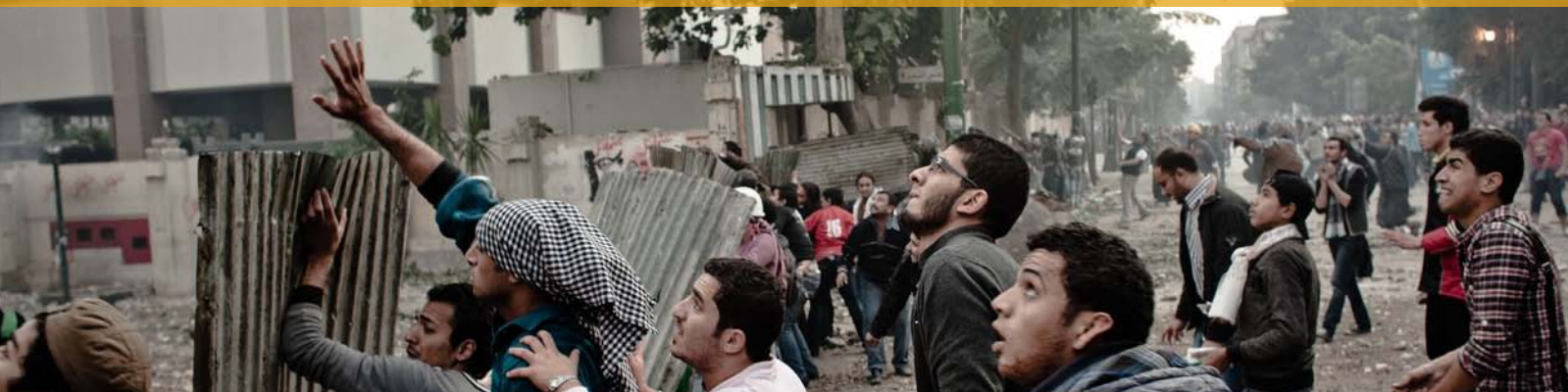
Youths protesting against government rule in Cairo