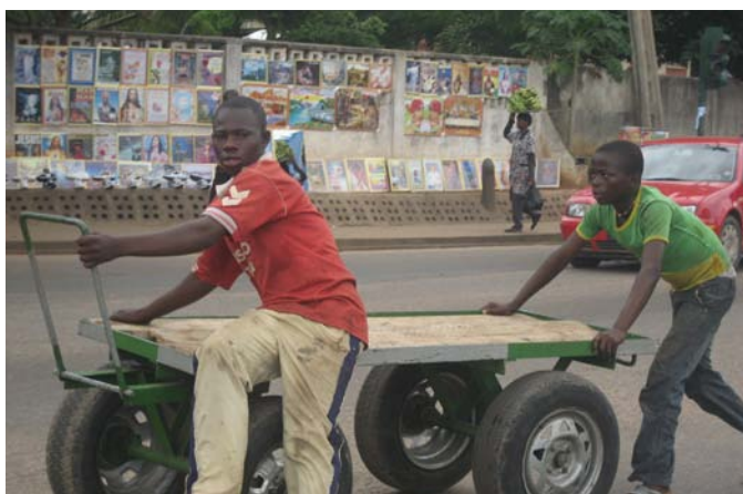
Young boys pushing a cart in Accra, Ghana].

The inability to find employment creates a sense of uselessness and idleness among young people that can lead to increased crime, mental health problems, violence, conflicts and drug taking. 11 There is a demonstrated link between youth unemployment and social exclusion.