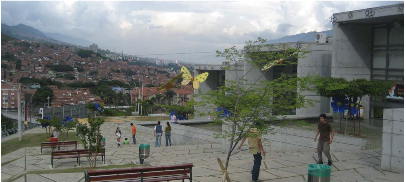
San Javier Park Library, Medellín, Colombia.