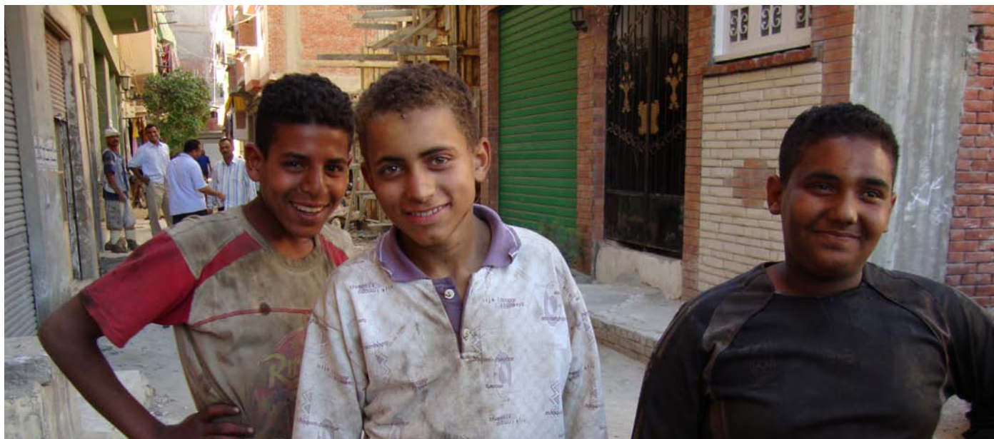
Three young Egyptian boys on a street in Cairo.