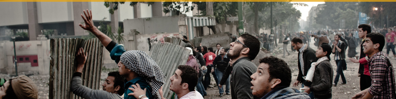
Youths protesting against government rule in Cairo