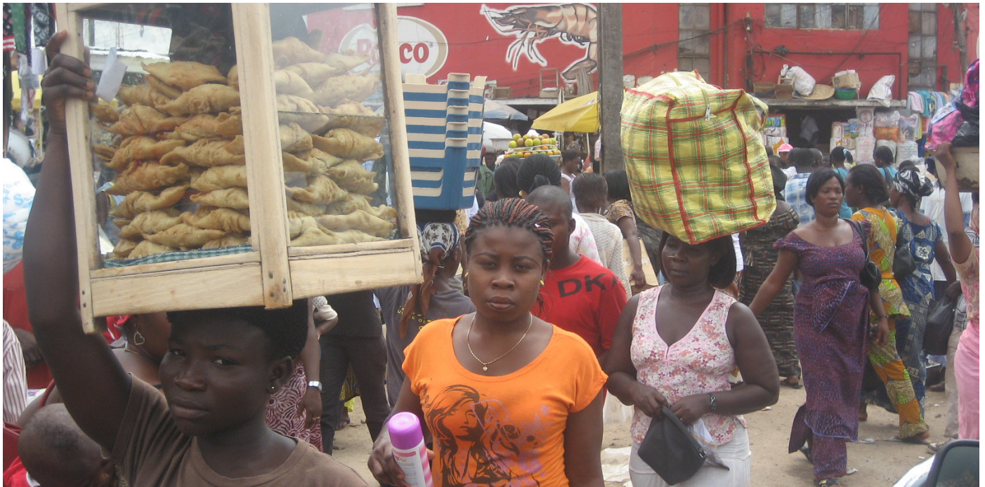
Young girls hawking goods in Accra, Ghana)