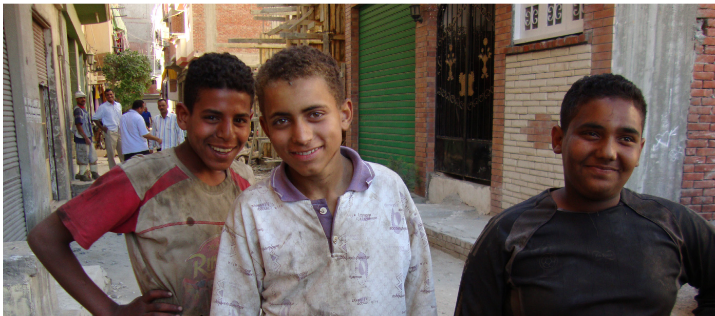
Three young Egyptian boys on a street in Cairo.