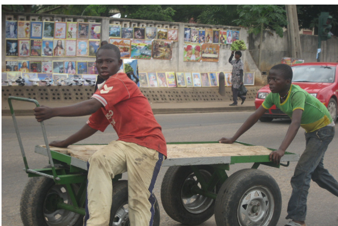
Young boys pushing a cart in Accra, Ghana].

The inability to find employment creates a sense of uselessness and idleness among young people that can lead to increased crime, mental health problems, violence, conflicts and drug taking. 11 There is a demonstrated link between youth unemployment and social exclusion.