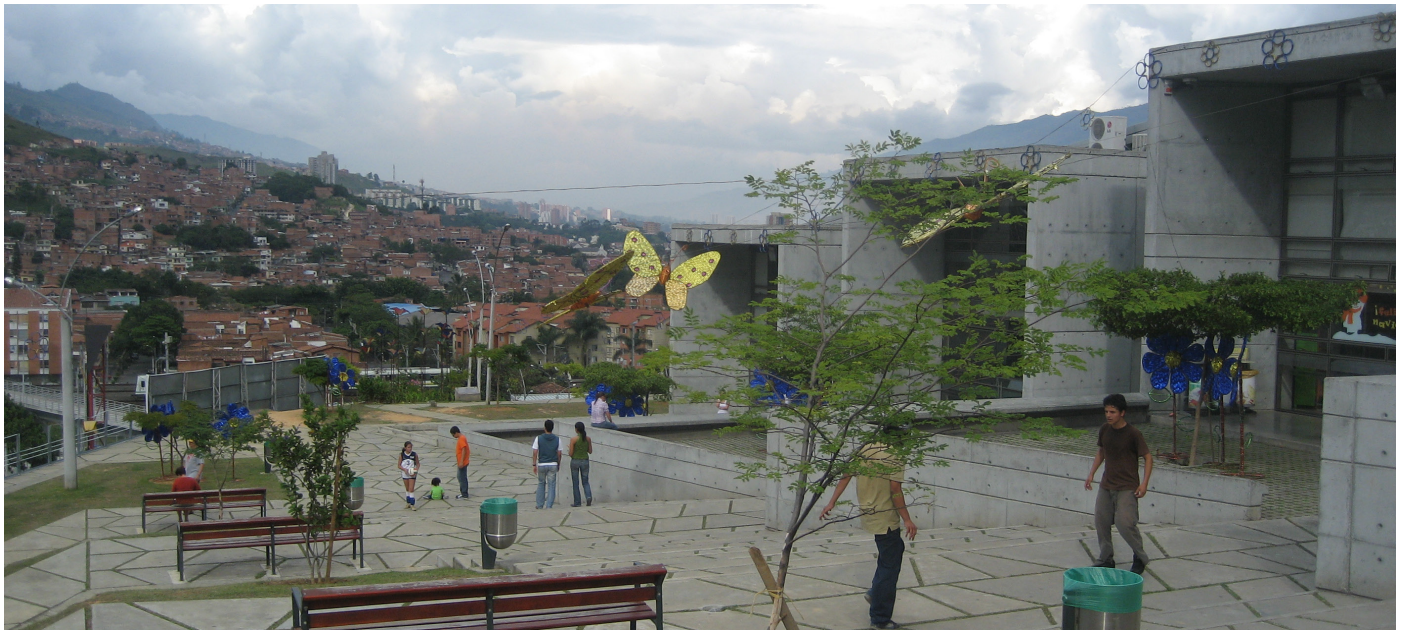
San Javier Park Library, Medellín, Colombia.