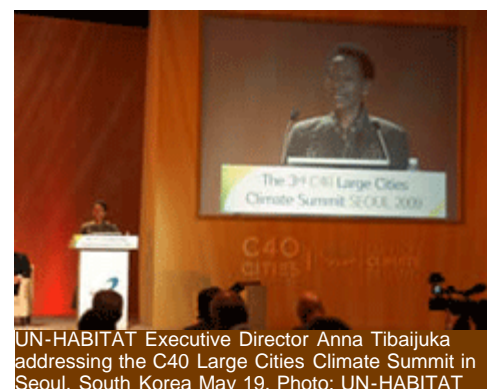
UN-HABITAT Executive Director Anna Tibajuka addressing the C40 Large Cities Climate Summit in Seoul, South Korea May 19.

Other deliverables of the joint work programme include an online catalogue to facilitate access to knowledge on cities and climate change and tools for incorporating climate change into city development strategies (CDS).