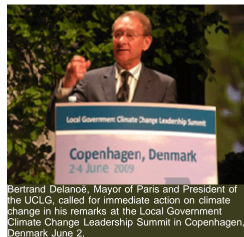
Bertrand Delanoë, Mayor of Paris and President of the UCLG, called for immediate action on climate change in his remarks at the Local Government Climate Change Leadership Summit in Copenhagen, Denmark June 2.

In conclusion, they recommended that low-income countries most vulnerable to climate-related disasters receive at least $1 billion in additional financial support.