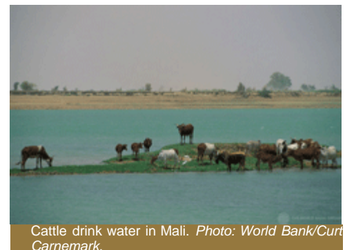
Cattle drink water in Mali.

The Declaration highlights major challenges and opportunities in the negotiations for a more equitable climate regime, and is expected to make a stronger case for support at the United Nations Climate Change Conference to be held in