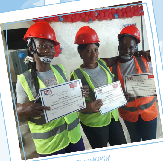
TRAINING ON WATER KIOSKS' MANAGEMENT

A participant to the women walk in Pipeline