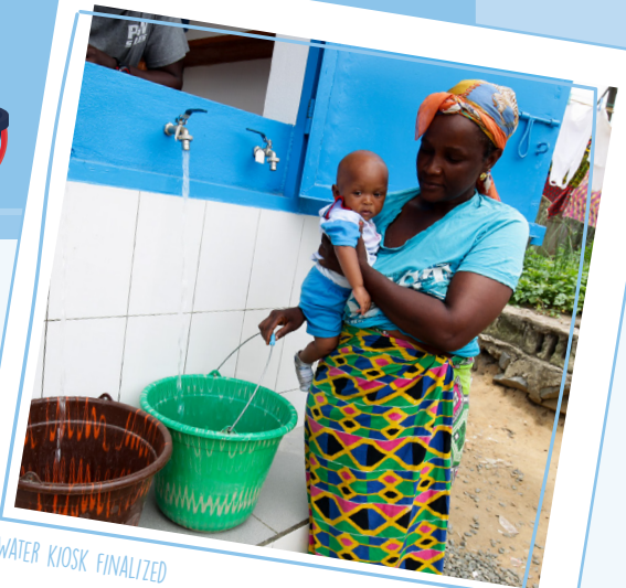
WATER KIOSK FINALIZED