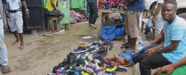
The informal economy - problem for a city manager or potential saviour of the national economy

Building the Hybrid Economy - Filling in the missing middle via the expansion of informal activities