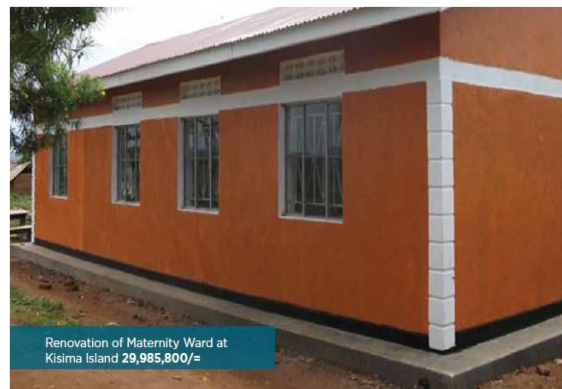
Renovation of Maternity Ward at Kisima Island 29,985,800/=

The community in Awindiri Ward, Arua extended water and water reservoir tanks to increase reliable access to water.