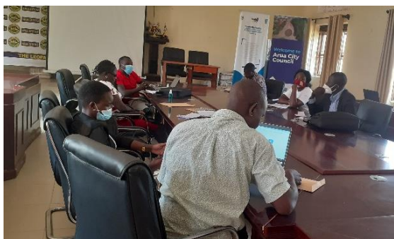
Arua City Development Forum, 2020-2021.

This involves coordinating and documenting prevalent stakeholder's category needs and issues, and then present them to the MDF Executive Committee for deliberation, prioritization, and submission to Council for resolution and adoption. The working groups also document and share problems identified in their respective thematic areas with the MDFs Executive Committees, Municipal Councils and MLHUD. They also propose appropriate recommendations on how best thematic critical issues and challenges can be addressed effectively.