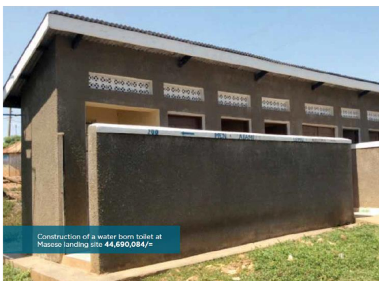
Construction of a water born toilet at Masese landing site 44,690,084/=

Masonko community on Kisima Island renovated its local maternity ward, which was in a deplorable state of repair.