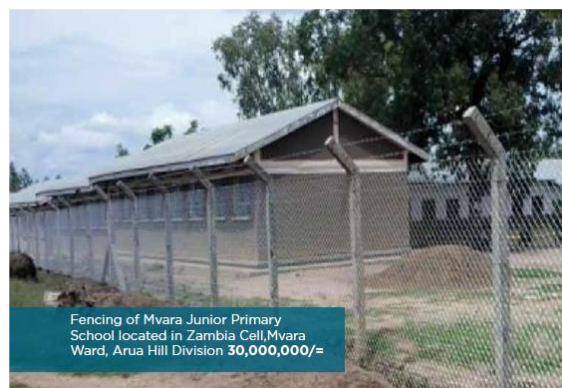
Fencing of Mvara Junior Primary School located in Zambia Cell, Mvara Ward, Arua Hill Division 30,000,000/=

The CUF supported the construction of a sanitation unit with toilet and bathing facilities in Masese landing site.