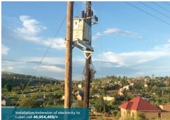
Installation/extension of electricity to Lubiri cell 46,954,469/=

The community in the Lubiri Cell neighbourhood of Mbarara decided to extend electricity to increase access to clean energy.