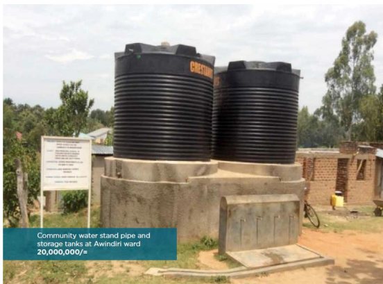
Community water stand pipe and storage tanks at Awindiri ward 20,000,000/=

The construction of a bridge in Nyabikoni Ward in Kabale improved connectivity and transport.