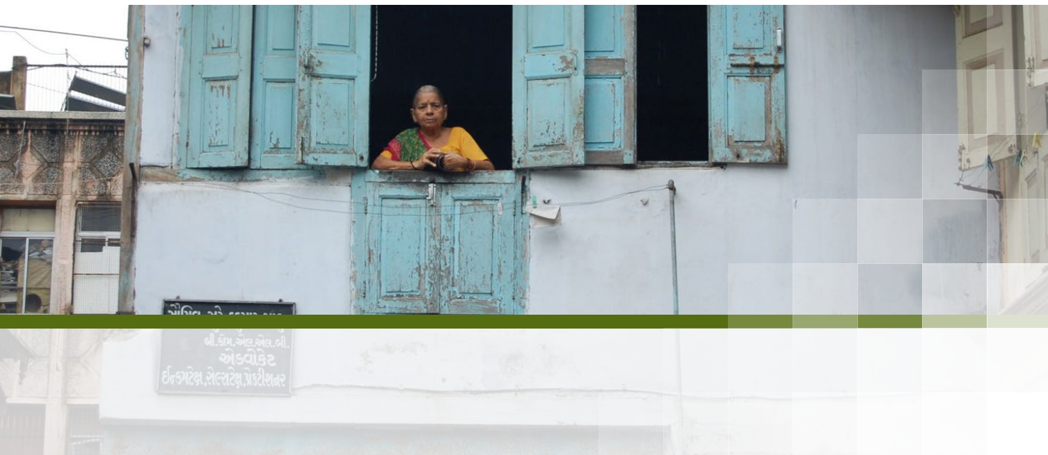
Resident of a community benefiting from a Cities Alliance pilot programme to promote inclusive, heritage-based city development in India.