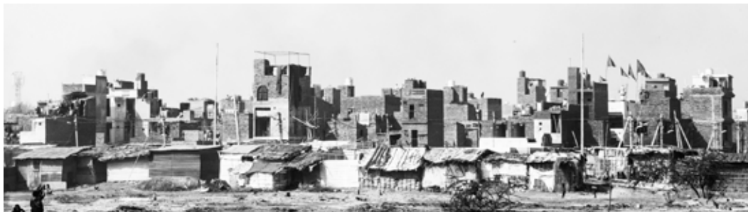
A resettlement colony in Bawana, Northern India.

The group tenure approach was successfully applied in Kathmandu, Nepal, when 44 households evicted from a riverside squatter settlement joined together with support from Lumanti, a local nongovernment organization, to form a housing cooperative. Members of the cooperative persuaded the Urban Community Support Fund to compensate them for eviction by purchasing a piece of land for them in the neighboring municipality of Kirtipur. The cooperative also established a savings and loan system, which facilitated the collective development of communal facilities such as water supply, waste treatment and emergency assistance, as well as housing development loans for individual families. 26