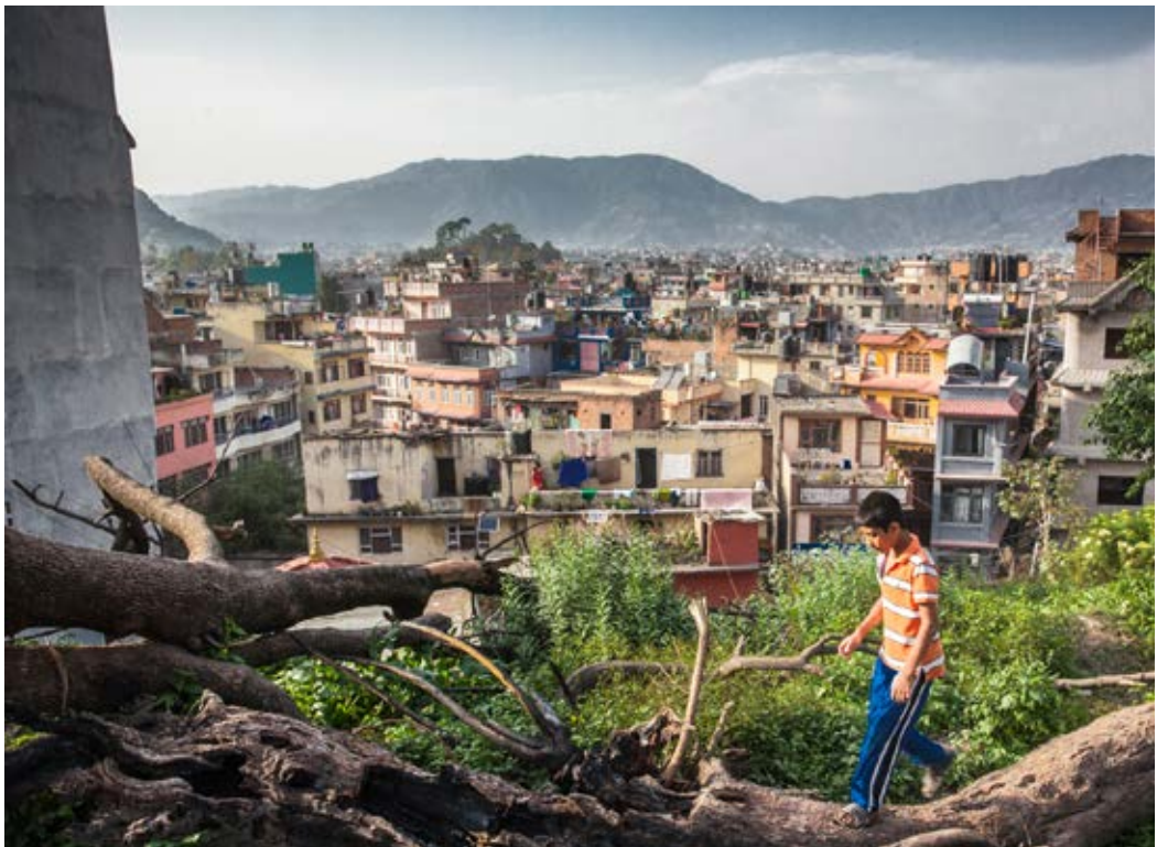
Eleven-year-old Sanjyal Koorala walks across a downed tree on a hilltop overlooking Kathmandu, Nepal.

Urbanization provides a distinct opportunity for economic, social, political and environmental transformation on a massive scale. It is one of the most significant global trends of the 21st century and communities, cities and secure tenure is at the heart of it.