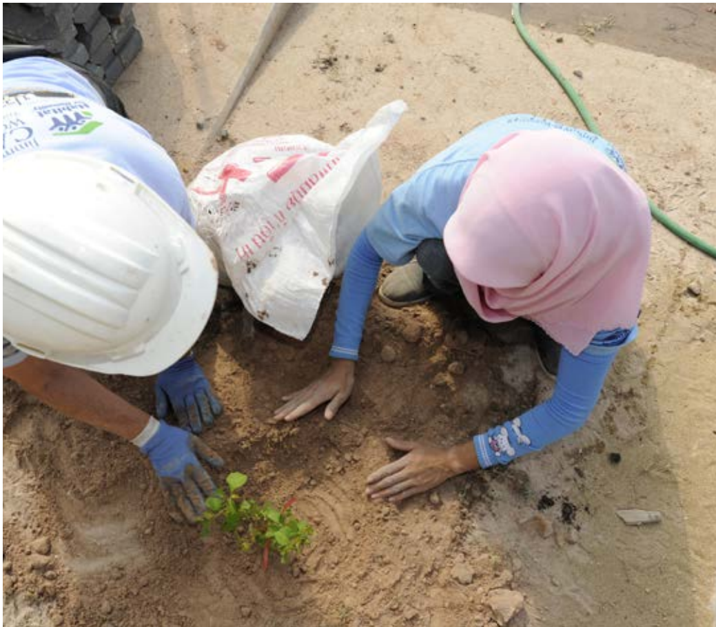
A family plants a sapling outside their new house in Chiang Mai, northern Thailand.

The Baan Mankong program has conducted projects in 1,010 communities in 226 towns and cities, in almost every province, involving 54,000 households. Collective rather than individual land tenure is now the norm in Thailand. Baan Mankong shows what can happen when there is a combination of community-driven slum upgrading, institutional and financial capacity and political commitment and leadership. 27 Its model is being replicated in Vietnam and Bangladesh and has also been used in 250 cities under the Asian Coalition for Community Action program implemented by the Asian Coalition for Housing Rights. 28