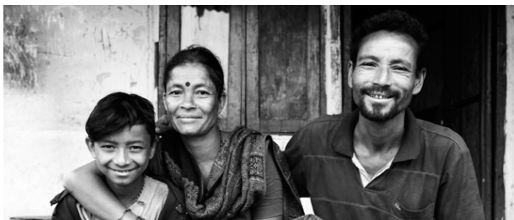
A Nepali family in Pokhara.

Looking at how to resolve the issue of insecure tenure is a critical step to address the growing housing needs in cities. However, security of tenure is not enough. Secure tenure must be part of a broader land and housing policy vision for the future of a city. In parallel with increasing security of tenure, the transformation of slums also relies on the creation of livelihood opportunities and the provision of social and economic services, either by the government, private sector, or through the efforts of communities themselves. Land tenure is key to improving quality of life, but cannot end poverty in isolation.