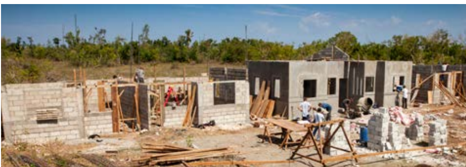
A housing project in the Philippines.

When resettlement cannot be avoided it should be done with the full participation of the community concerned to ensure members can make informed decisions, discuss the options and make plans for their future housing. To successfully mitigate the effects of resettlement it is essential to understand the effect of resettlement on all stakeholders. These include local communities, project authorities, donor representatives, approving and implementing agencies, affected households, and non-governmental organizations. 17 Information exchange and joint decision-making are key facets of participatory resettlement.