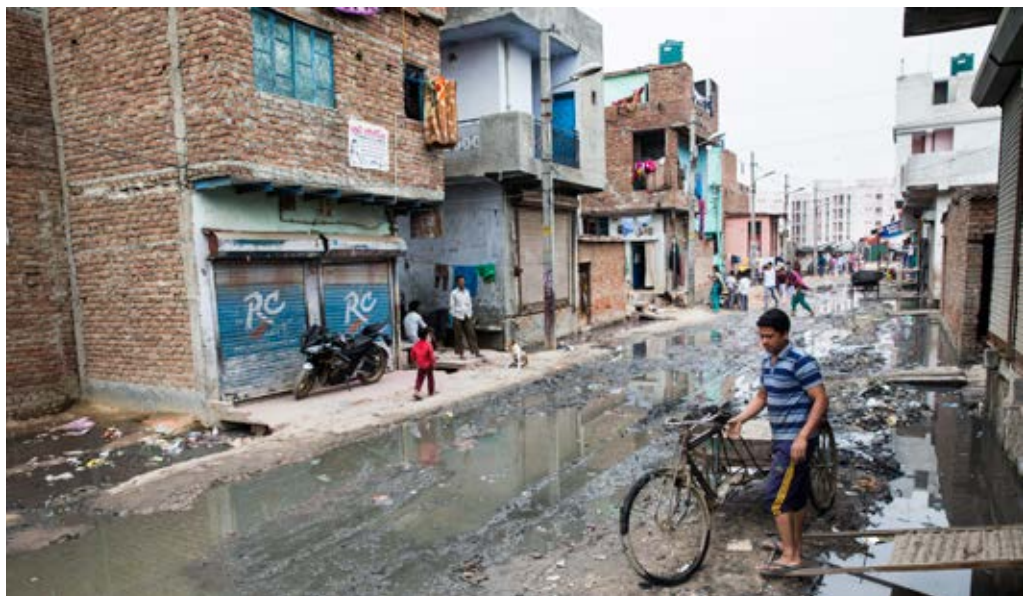
A resettlement colony in Bawana, Northern India.

Increasing security of tenure creates incentives for progressive improvements in slums and housing which leads to sustainable communities and aids urban resiliency by fostering communities that are better prepared to cope with disasters. However, a holistic, multi-sectoral approach is required for true transformation.