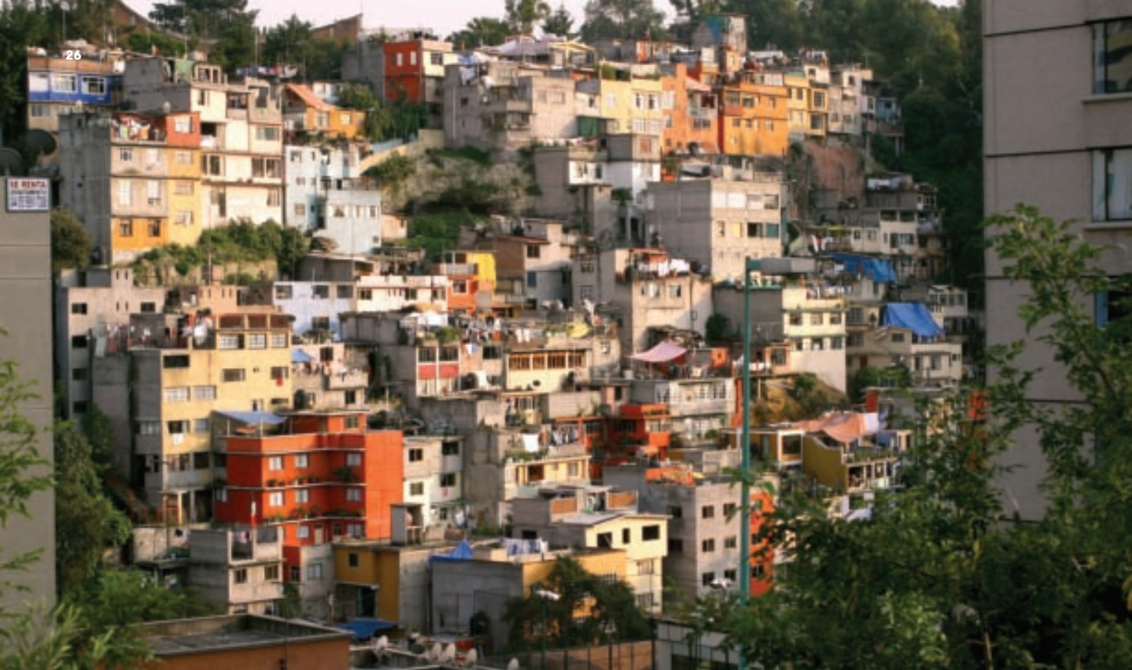
Poor neighbourhood built on a hill in Mexico City, Mexico

Each of the three legs of Cities Alliance—the Consultative Group, the Executive Committee, and the Secretariat—retained their fundamental responsibilities during the period under the review. At the same time, they each adopted new roles that reflected the changes associated with the organisation’s transitional process.