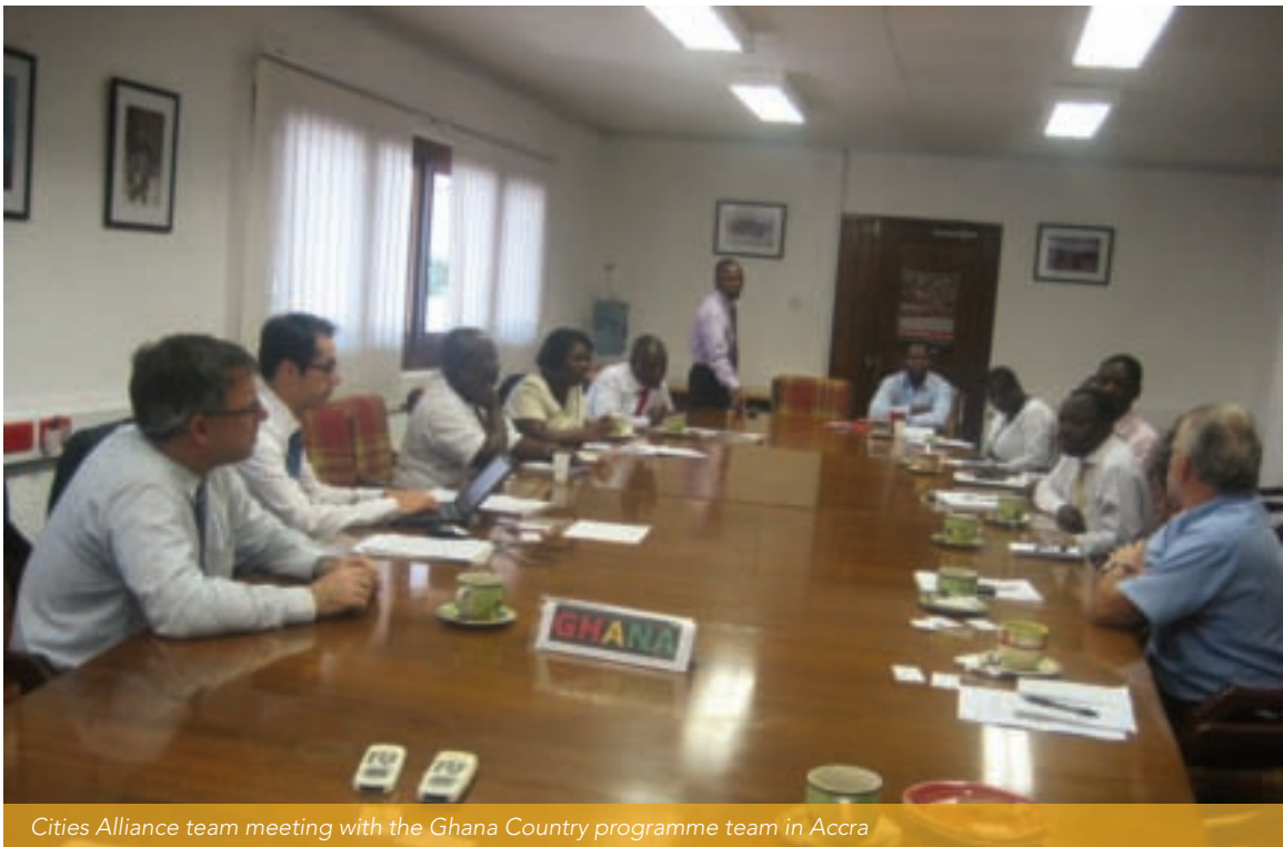
Cities Alliance team meeting with the Ghana Country programme team in Accra

To delegate responsibility and enhance efficiency, staff were assigned to one or more of the four teams units, each of which is led by a Team Leader responsible for establishing and following a well-defined work programme and budget (see table on the following page).