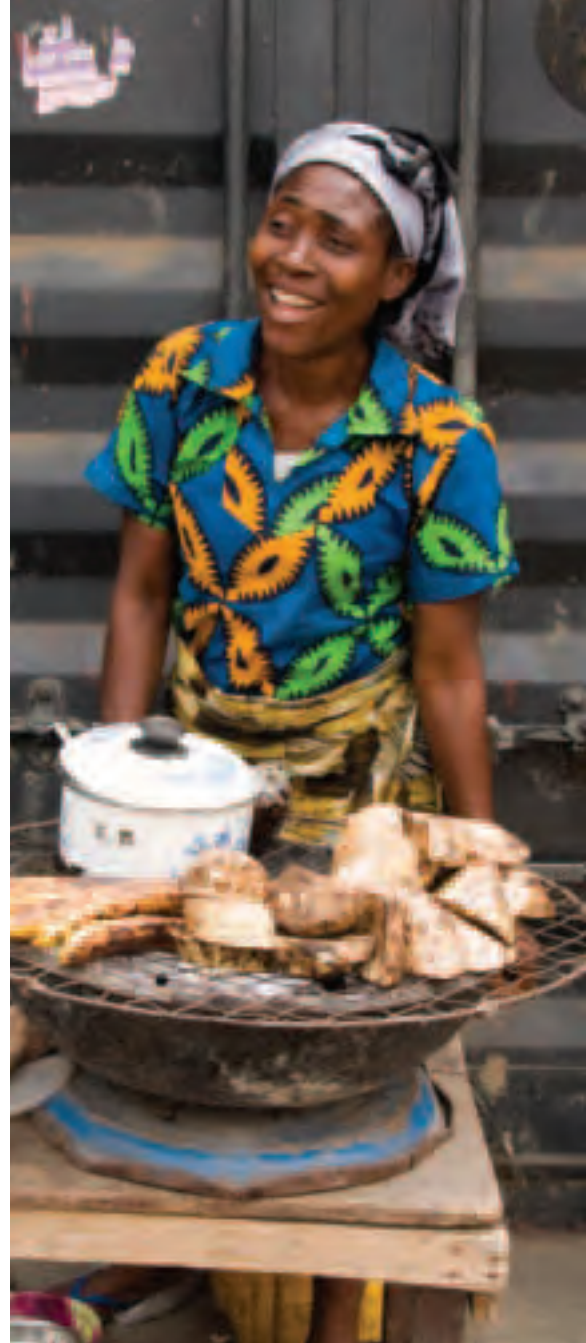
Jankara Market in Lagos, Nigeria.

The financial highlight of FY09 was a commitment of $15 million to the Cities Alliance from the Bill and Melinda Gates Foundation for of the Land, Services and Citizenship programme. The project will be implemented in five low-income countries, working programmatically to facilitate a partnership between area-based organisations of slum dwellers with all levels of government. The project is supported by Cities Alliance members to develop citywide strategies to upgrade existing slums and to help cities and their citizens plan and implement strategies for future growth.