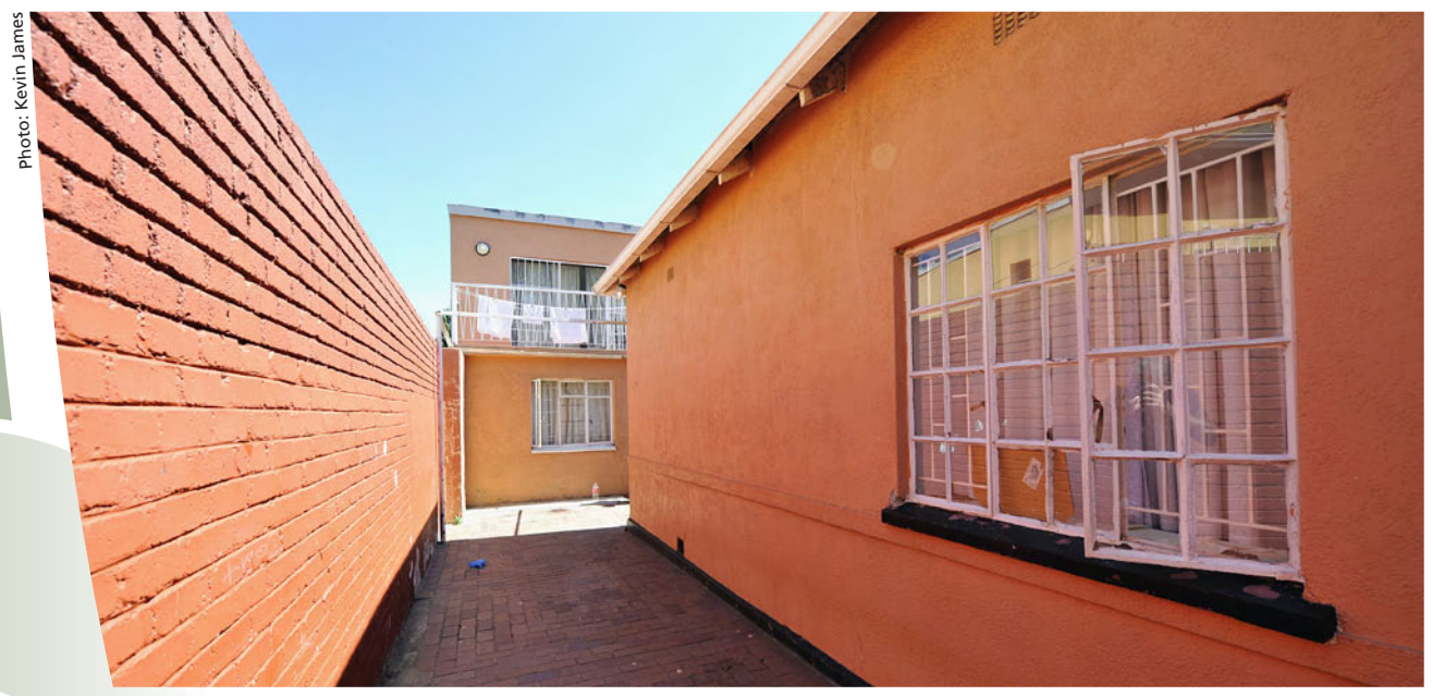
Multiple-room units for rent in a backyard with the main house in the foreground