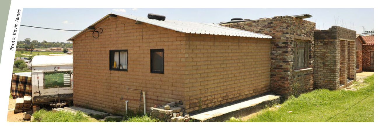
Additions to an RDP house, with caravan accommodation on the left

There is also an increasing awareness that current housing programmes do not meet the human settlement requirements of all households (which goes beyond merely "a house per household"). The inability of the state's subsidy policy to meet the required diversity of affordable accommodation demand is clear. This was acknowledged in the Breaking New Ground (BNG) strategy revision in 2004, yet the stated intent to offer a greater choice of tenure, location or affordability has to date not been realised to any significant degree. Prioritising fully subsidised, low-density, detached, freehold family accommodation over other delivery modes, tenure systems and accommodation outcomes is therefore