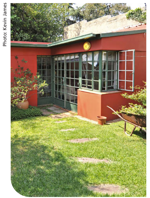
A suburban garden cottage freestanding from the main house

The case study also examines various barriers to more effective delivery of housing by this sub-sector, for example, perceptions that it promotes 'slums', and various current policy and delivery failings or gaps.