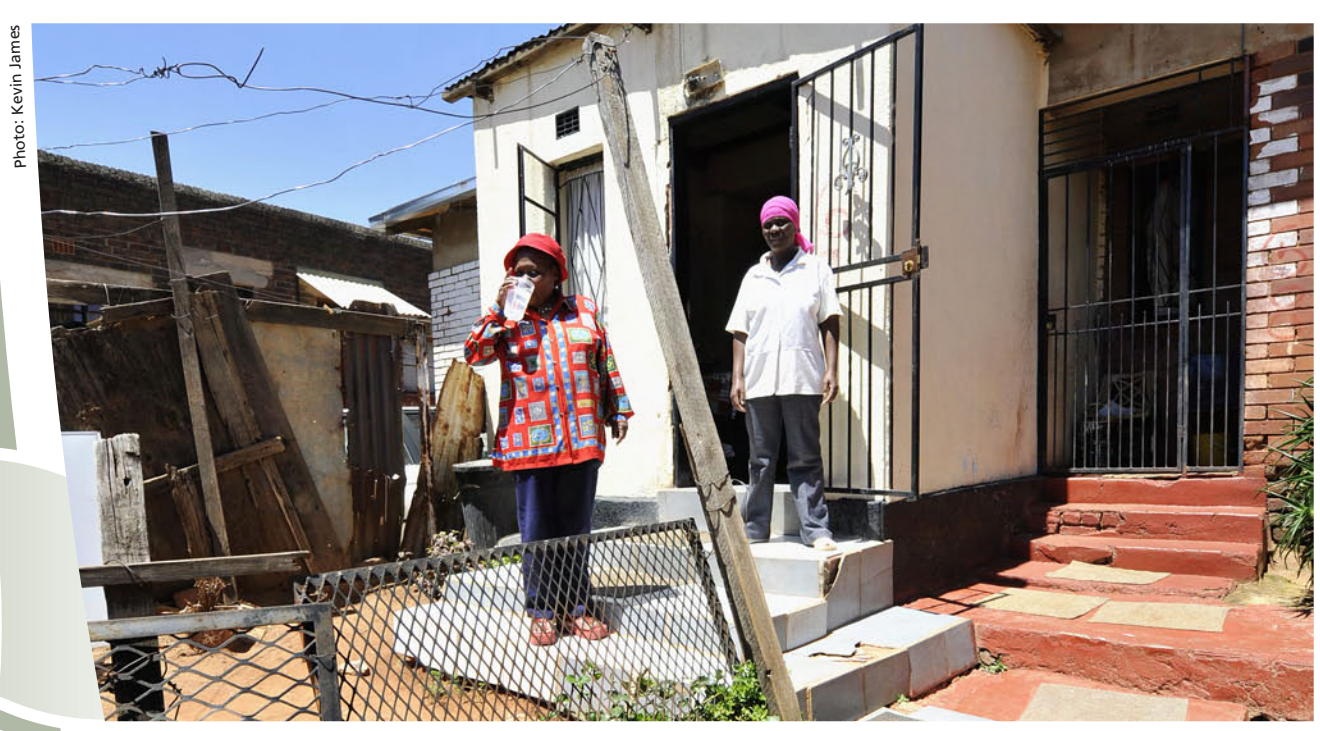
A room for rent built on to a house

It is generally recognised that the state, under current policy, cannot deliver housing (whether to buy or to rent) on the scale required in South Africa at a sustainable rate and within the means of lower-income households. For example, the cost of providing RDP houses for the estimated 1.2 million households in informal settlements (such households are estimated to be growing at a rate of between 2% and 6% per annum) has been estimated at R84 billion, or 70% of the projected national housing budget from 2009 to 2015.