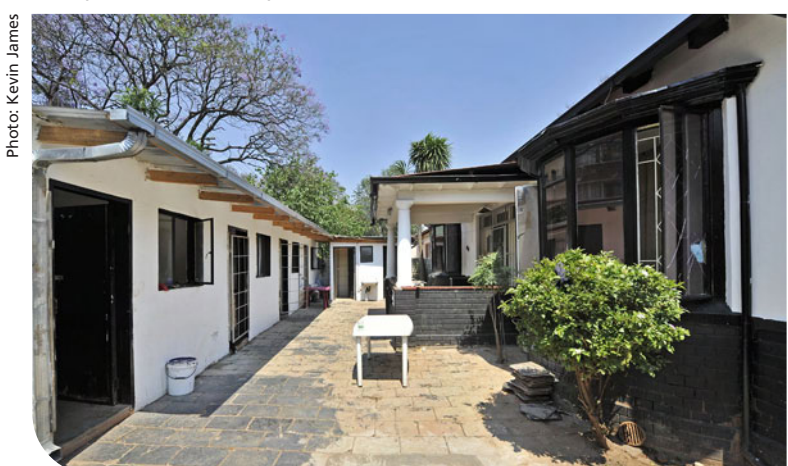
Multiple small-scale private rental opportunities in a low-density suburb

The large numbers of existing properties in low-density housing areas on which most or all of the above preconditions are met present a major human settlement opportunity in South Africa. This offers a potential short-cut to the provision of acceptable accommodation compared to other delivery systems that are currently not very effective in creating viable human settlements.