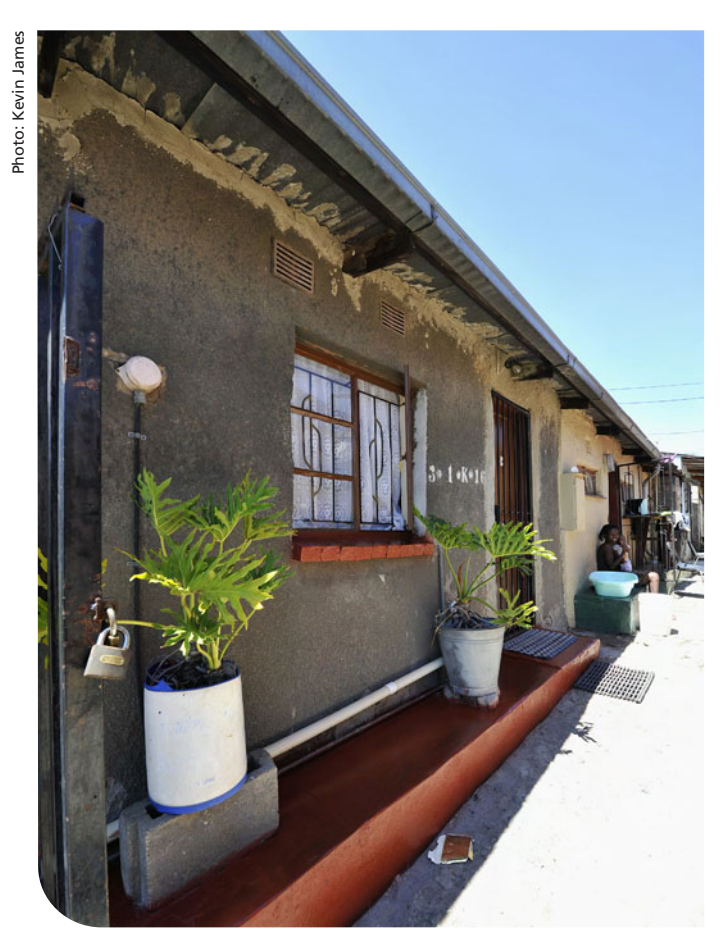
An example of rental units down the length of the site

This definition excludes corporate and publicly owned accommodation as well as rental of units in informal or illegal settlements. It also excludes social housing and housing co-operatives.