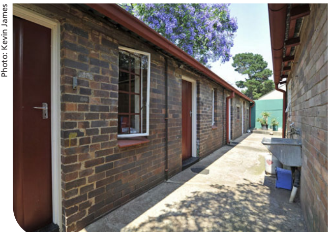
These rooms for rent are of a good quality

Small-scale private rental has potential as a "quick win" delivery system that could rapidly produce affordable and acceptable accommodation without placing significant demands on the state. In addition, through densification of existing human settlements, various economic benefits can be achieved, such as