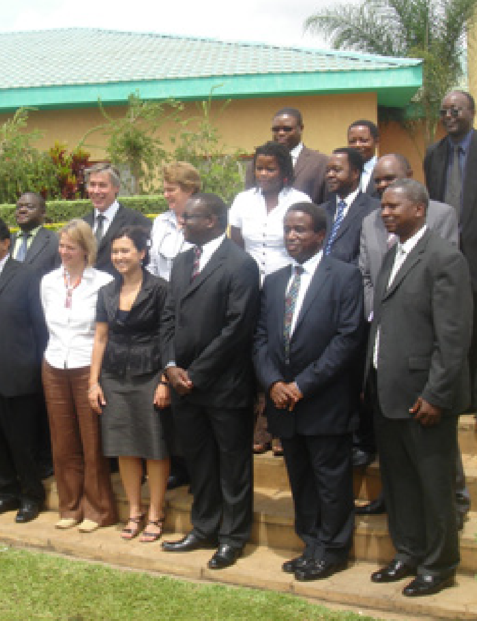
Members of the teams from Lilongwe, Johannesburg and UCLG in Malawi

and the Norwegian government, the mentoring programme is very different from pre-existing partnership arrangements between cities.