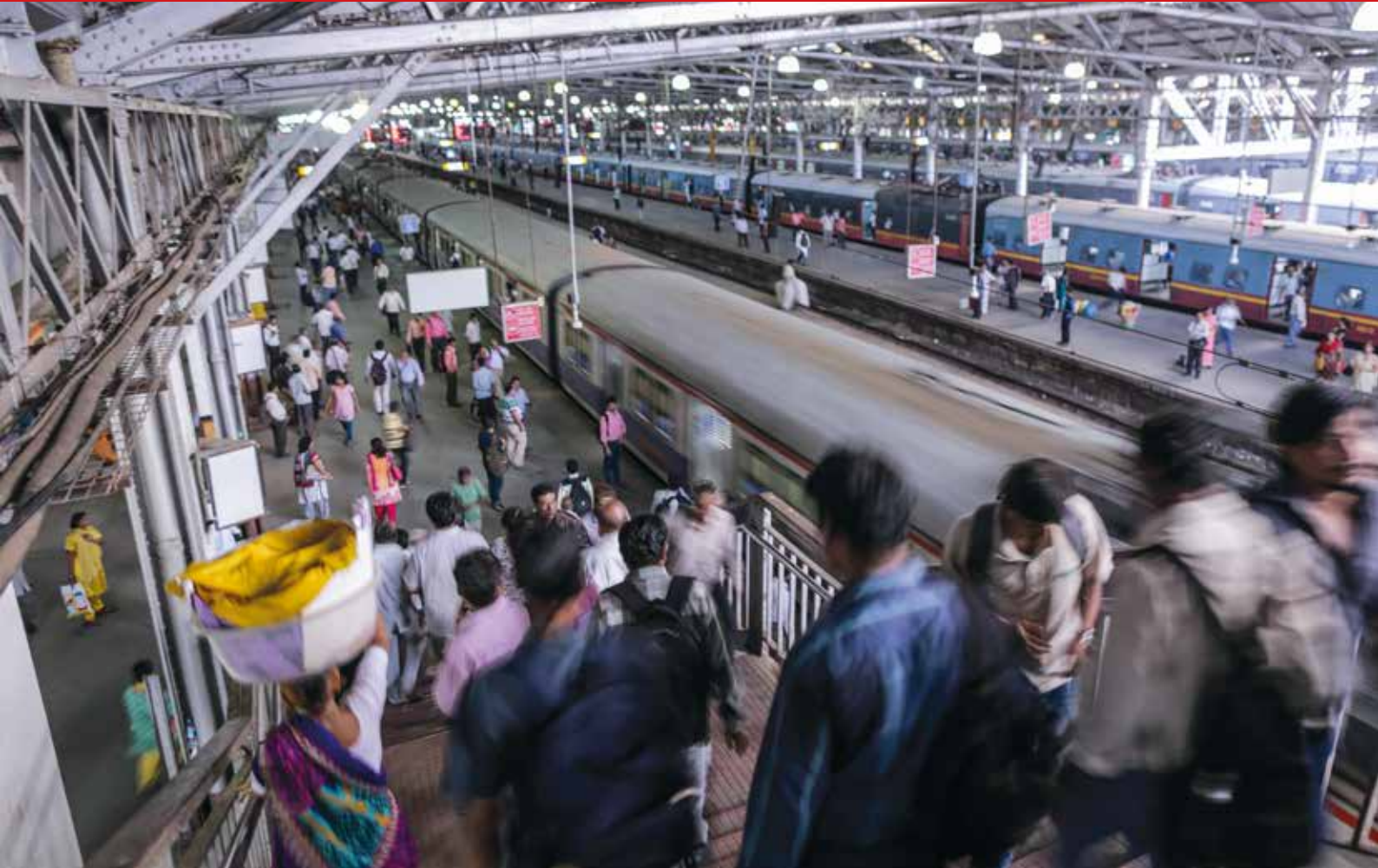
The Indian railways power ahead

No economy can thrive without reliable sources and supply of energy, especially electricity. Public space is essential to the livelihoods and productivity of informal workers, who often operate in the streets and open areas of the city.