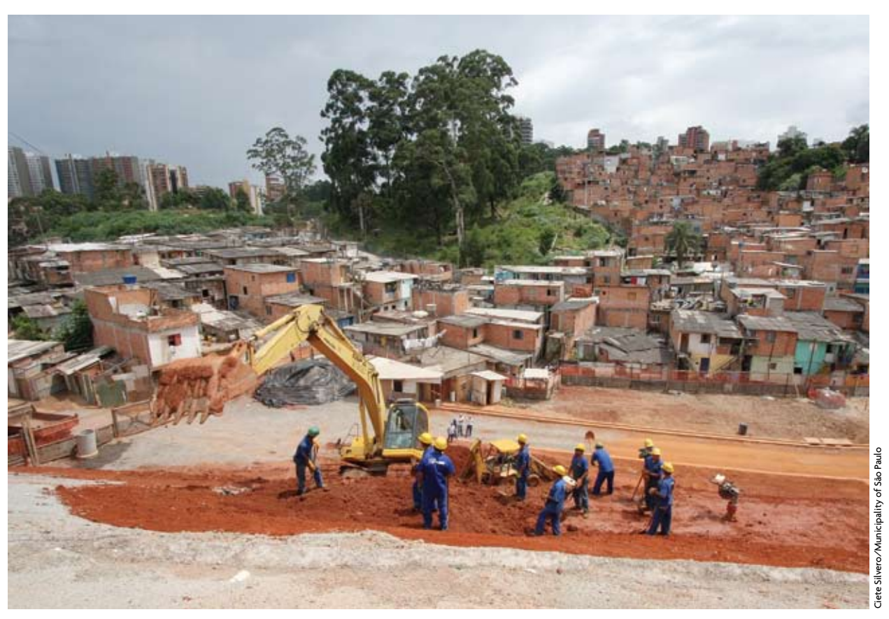
Breaking new ground for slum upgrading in Paraisópolis in Brazil

Over the next few years, the Cities Alliance will develop a more programmatic approach to the support that it provides to cities and countries. Such support should combine activities at both the city and national level, designed to influence and guide national policy formulation, such as: