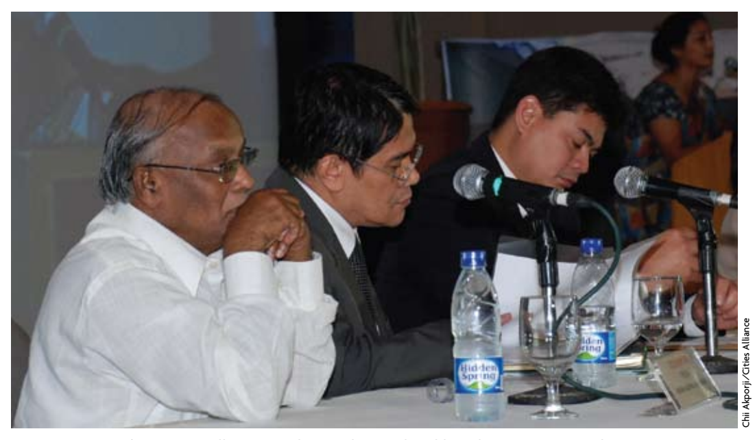
Representatives of new Cities Alliance members at the Manila Public Policy Forum, November 2007

house for a range of projects. It is better understood as a catalytic mechanism, increasingly able to identify and fill important knowledge gaps, influence and take forward the international debate on urban poverty reduction and improve the quality of support delivered to developing countries and cities through increased collaboration between its members. Indeed, the Cities Alliance is uniquely positioned to provide incentives to enhance coherence of effort and local ownership, both of which are fundamental to achieving the aims of the Paris Declaration on Aid Effectiveness.