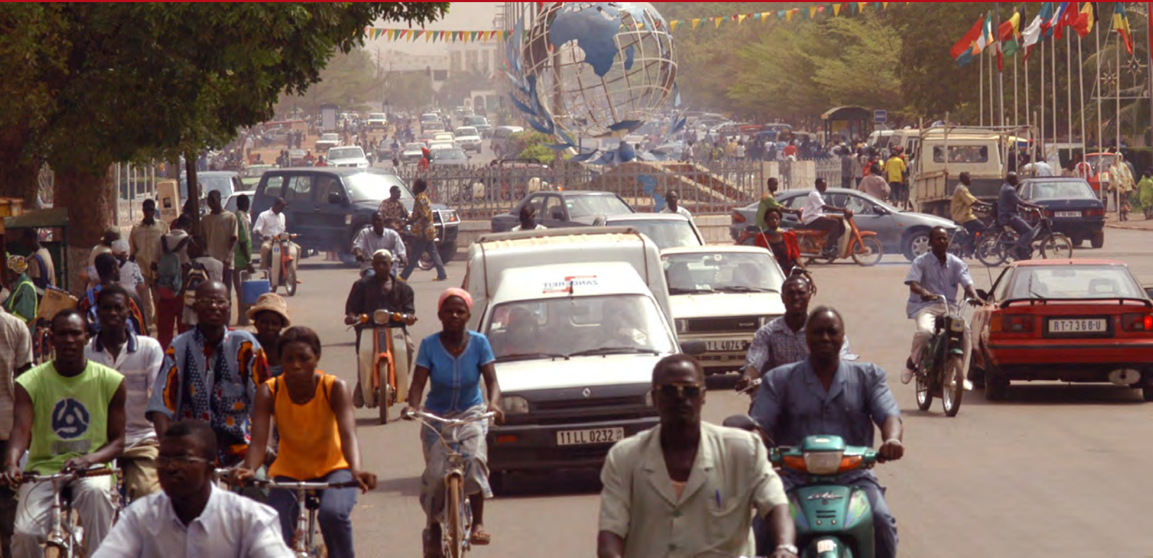
The United Nations Square in Ouagadougou.