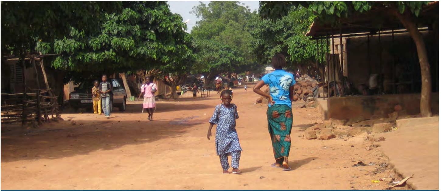
Street scene in Bobo Dioulasso, Burkina's second largest city.