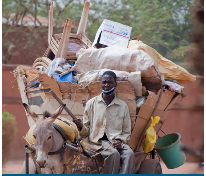
A garbage collector's cart in Ouagadougou.

Some 76.5 of Burkina Faso's urban residents live in slums, according to UN estimates.